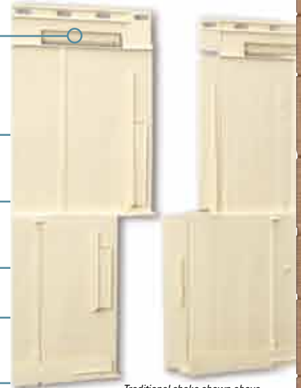
Traditional shake shown above.

Weep slots along the bottom edge of the panel help relieve any humidity build-up between the cladding and the wall.